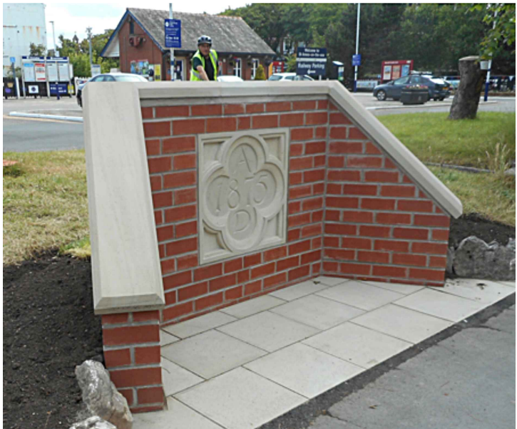
The replica 1875 date stone installed in 2022 in front of St Annes Station and across St Andrew's Road North, directly opposite to the Tiles Bar.