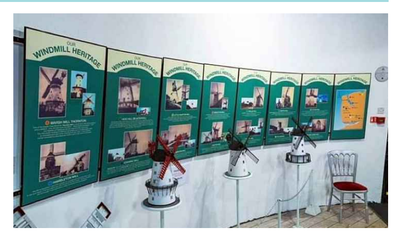
Three models made by Ken Buckley form the centre piece in the Windmill Exhibition

The following year, over winter, he built a range of models of the Fylde Windmills. Three of these are on full time display, in pride of place, by the main entrance of the Windmill museum, along with other models elsewhere in the museum.