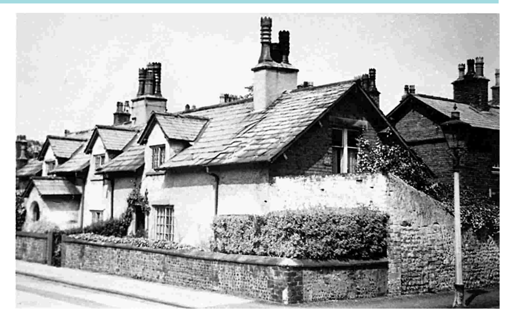
Grove Cottage, Gregson Street

During the decorations two bricked-up doorways were revealed, suggesting that