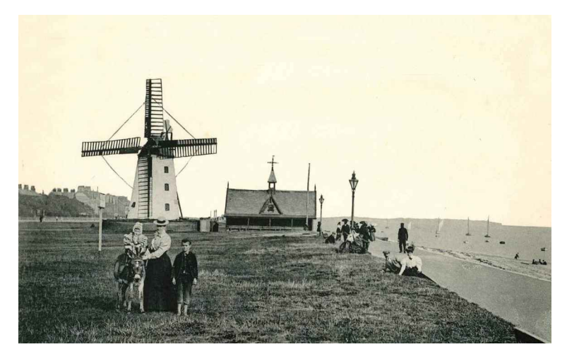
Lytham Green with the Windmill still with its large working sails and some of the fishing fleet moored in Lytham Pool to seaward of the Lifeboat House.

When the districts of Lytham and St Annes on the Sea amalgamated, the Squire gave the new borough (then Lytham St Annes) all the seaside land between the old Custom House and the slade at Ansdell Road. The old windmill was included. It may be of interest to Heritage members to know the nature of the covenants involved in the Lytham Green Documents which we have at the Archive.