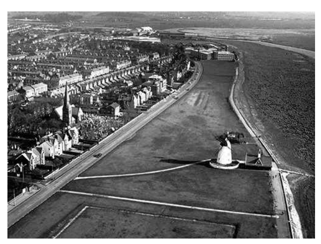
The east end of Lytham Green

3 The Borough would maintain and keep in good order the stone hulking, sea wall or embankment and the stone steps,