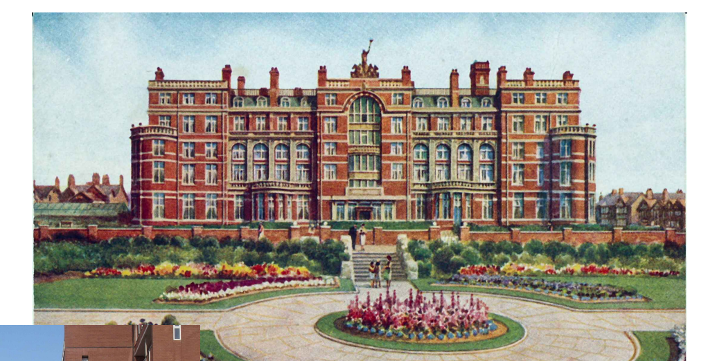
Imperial Hydro decorative stones in Woodville Terrace, Lvtham

The only other memento of what was the country's largest seaside hotel when built is the remaining gate posts with "IH" on the top, still in situ in St Annes Road West in front of the Majestic Flats which replaced the building. David Forshaw