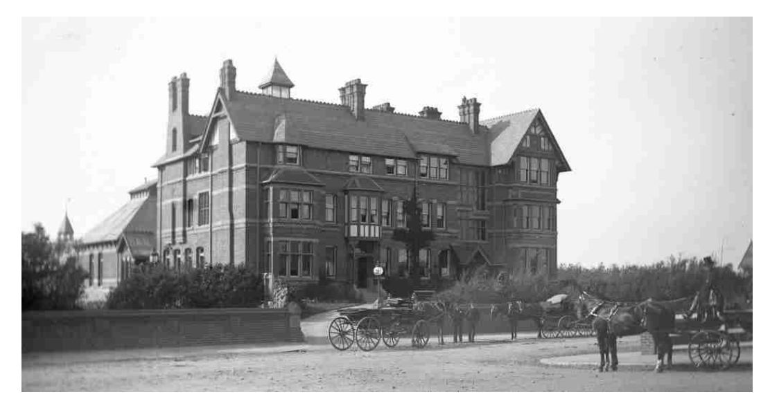
The first St ANNES HOTEL