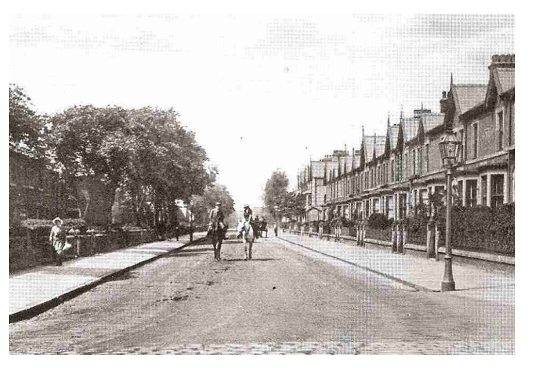
A much quieter time in Westby Street

the data can be interpreted in different ways. Noting all forms of employment in the returns, it can be seen that domestic servants and dressmakers were among the most common occupations but they were not usually the work of the breadwinners. In the region of 10% of householders were selfemployed as boarding-house keepers for much of this period but, towards the end of the century, over 20% of the heads of families were dependant on income from